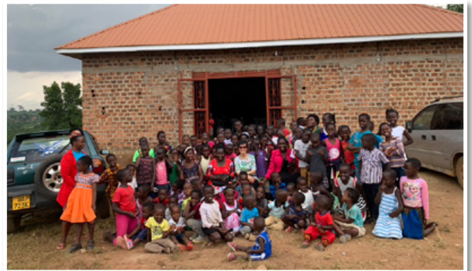
► Kawanda area VBS