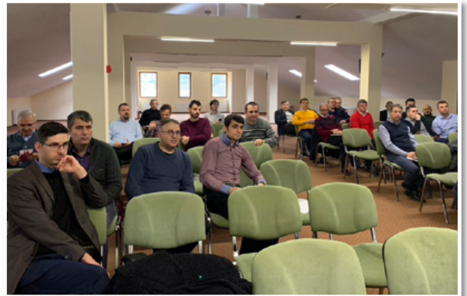
► Pastors' Training in Children's Ministries