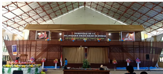
► Final State of the Ark

On March 15-21, 2020, EIUC CHM director, Lieke Lilir Sibilang, organized a big CHM 25th Anniversary celebration in conjunction with the union-wide evangelistic meetings to be held at Tompaso Academy, Minahasa Conference. It was amazing to see the entire stage emerged as a mockup of Noah’s Ark measuring 33 long, 6 meter wide and 8 meters high. The children preached, sang, and performed inside the ark. Indeed, it captivated the audience! The opening night saw the hall filled to capacity with over 400 children and adults attending. Unfortunately, COVID-19 spread so quickly around the world that it became a pandemic. Hence, the Indonesian government announced the need for social distancing and the entire evangelism outreach program came to an end just after one night of meeting. The children were greatly disappointed, but not discouraged for they know that they will have an opportunity to witness for the Lord again when the crisis is over.