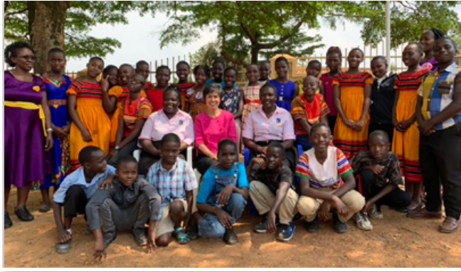
► TMI Baptismal candidates happy to accept Jesus