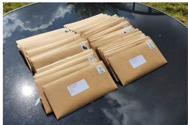
► Letters from God

“Praise be to the God and Father of our Lord Jesus Christ, the Father of compassion and the God of all comfort, who comforts us in all our troubles, so that we can comfort those in any trouble with the comfort we ourselves receive from God” (2 Corinthians 1:3–4).