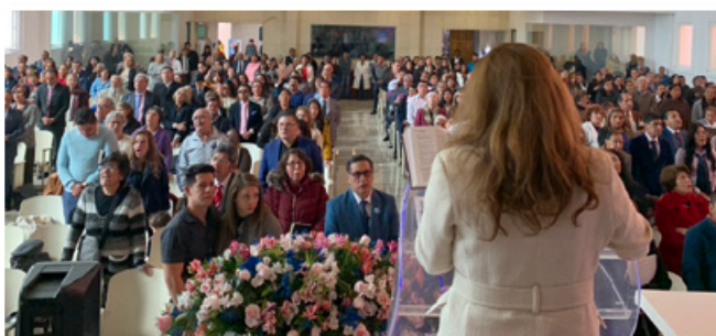
► CHM Training in Central Mexico Union