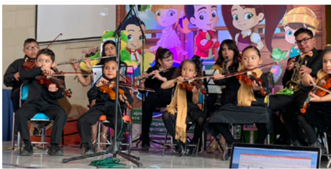
► Kids Participating in Special Music