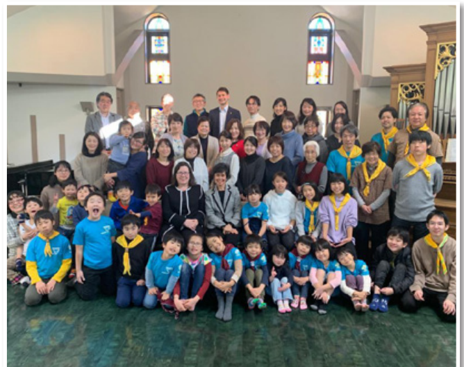
▶ Training at Koganei Church, Tokyo