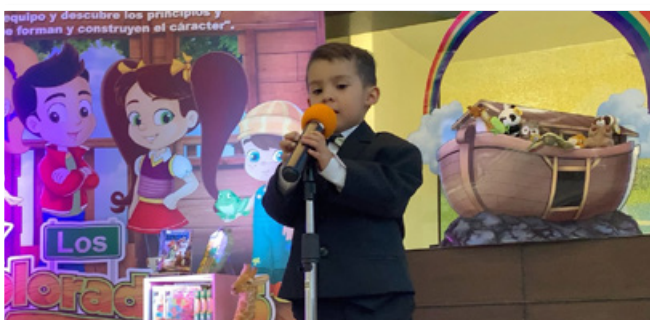
► 4-year-old sharing a testimony