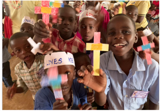
TMI kids with their crafts