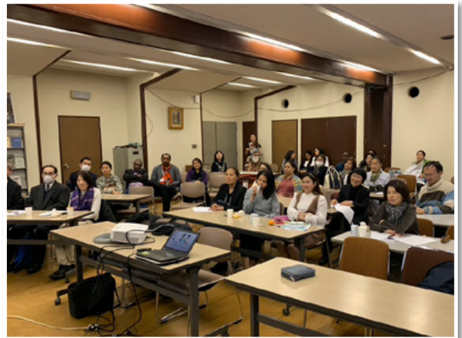
▶ CHM Training in Harajuku Church, Tokyo