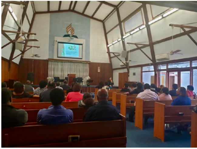
▶ CHM Training at the Cabramatta Central Church in West Sydney