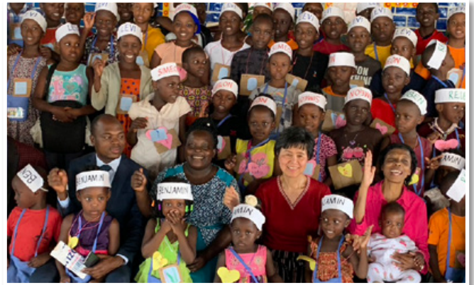
► Kampala, C. Region VBS

experienced Babylonian times when Daniel was serving as a high-ranking officer through the Babylon VBS. On Sunday the children learned to make purses and keychains. CHM leaders in Kawanda also conducted VBS and everywhere 60-100 children were excited to participate in the singing, the Bible stories, and the crafts. May the seeds of the gospel be sown in these little hearts as they respond to the love of Jesus.