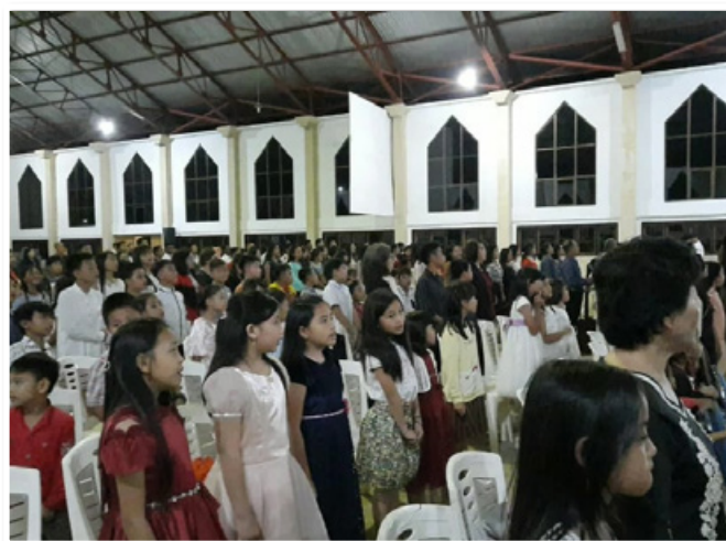
► A full hall on the opening night of the evangelistic meeting