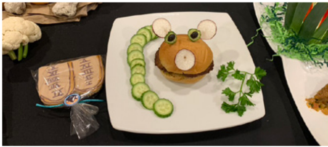
► More Food Designs