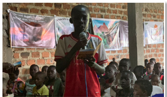
► Boy reciting memory verses at the Kawanda VBS