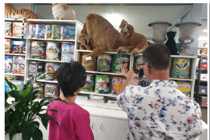
► A Potpourri of VBS Kits & Stuffed Animals in the Children's Resource Center