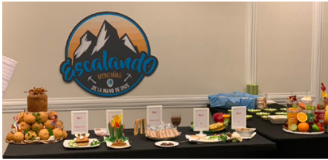
► Escalando Montanas VBS Food Station