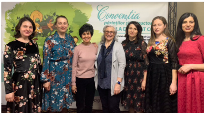
► Some Teachers with the Presenters