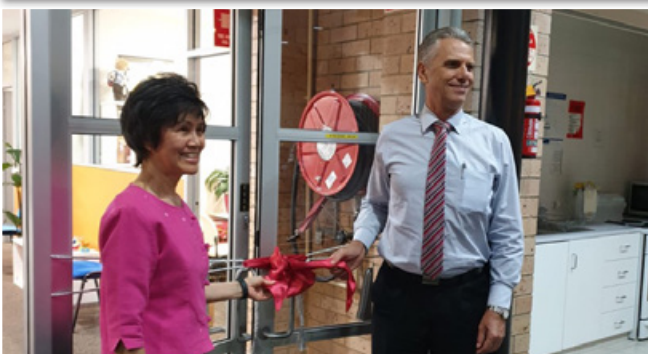
► Opening of Creative Spaces Children's Resource Center at NNSWC