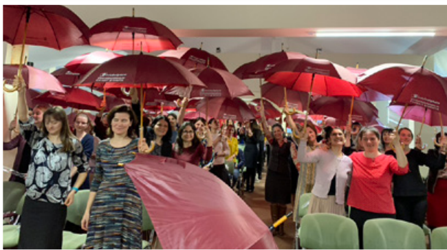
► Children's Sabbath School Teachers with Umbrellas