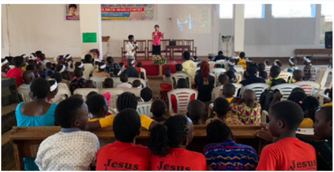
Kids Listening Attentively at the TMI Evangelistic Meetings