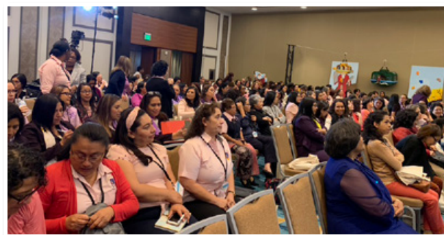
► IAD CHM VBS Training