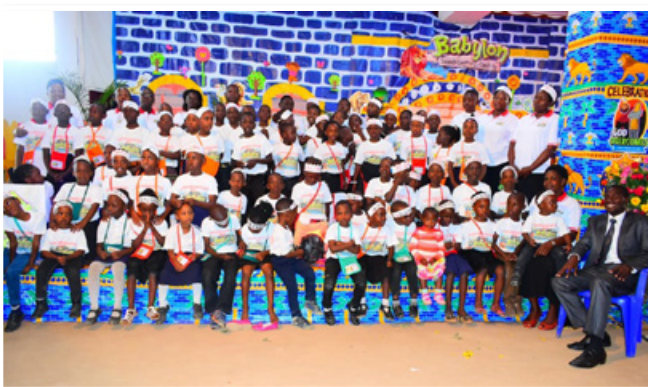
► Babylon VBS at Makerere Church