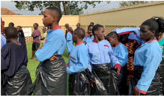
► Baptismal candidates getting ready for baptism

experienced Babylonian times when Daniel was serving as a high-ranking officer through the Babylon VBS. On Sunday the children learned to make purses and keychains. CHM leaders in Kawanda also conducted VBS and everywhere 60-100 children were excited to participate in the singing, the Bible stories, and the crafts. May the seeds of the gospel be sown in these little hearts as they respond to the love of Jesus.