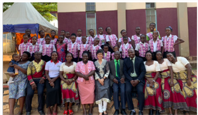
Makerere Church children's choir with speaker and CHM