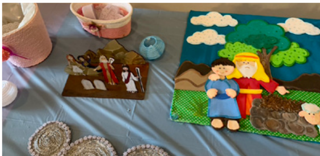
► Bible Story Station