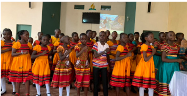
TMI children singing