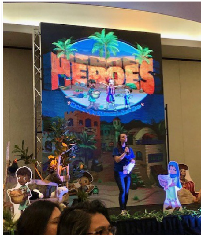
► NAD CHM Retreat