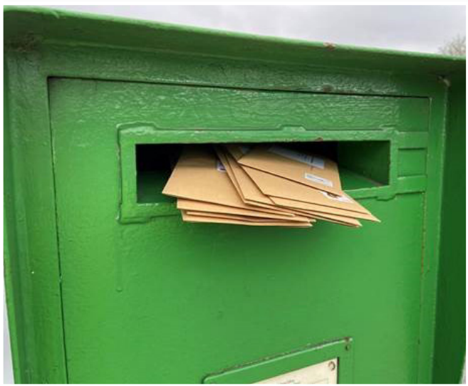
▶ Letters from God

In this changing world, now more than ever, we all need God. As the daily struggles and death tolls increase, we can easily fall into despair. What better way to remind them that God will not leave them in the darkest moments; His love will strengthen them and when life gets tough, God's love doesn't waver.