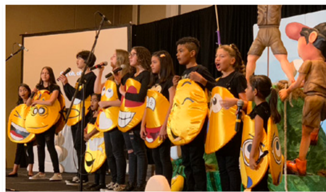
► IAD Children & Teens singing the VBS Theme song