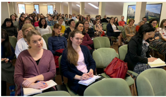
► Children's Sabbath School Teachers Listening Attentively

There were tours of the North American Division offices and the Museum of the Bible. The highlight of this retreat was the