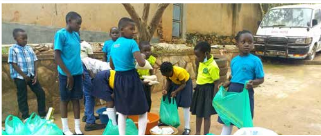
► ECD children on world orphans day.

Local churches throughout ECD highlighted the importance of World Orphans & Vulnerable Children’s Day on November 20, 2021. Children packed food to distribute to orphans and other needy families. It was a great opportunity to involve children in reaching out to the less fortunate!