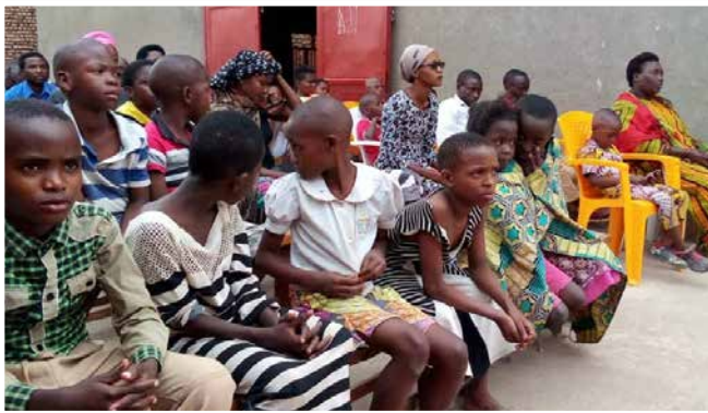
► One TCI evangelistic site.

made in sharing God's word with those who attended night after night. At the end of the meetings, 71 people made their decision to be baptized. May God continue to bless these children who are using their gifts and talents for the Lord.