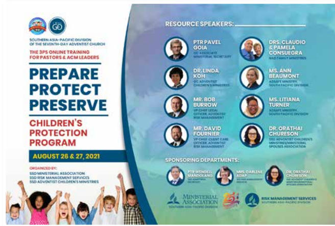
► SSD Division-wide 3P's Online Training for Pastors & Children's Leaders

American Division, South Pacific Division, and Adventist Risk Management were invited to present interesting and valuable topics on child abuse prevention. It was well attended by about two hundred leaders.