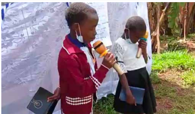
► Patience and Prispine in TCI Evangelism.