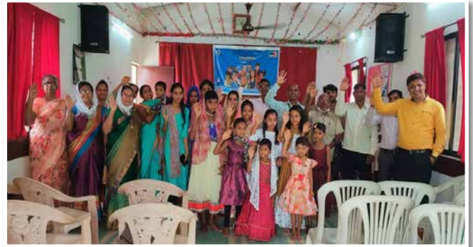
► Western India Union