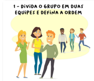
▶ SAD Leadership training.