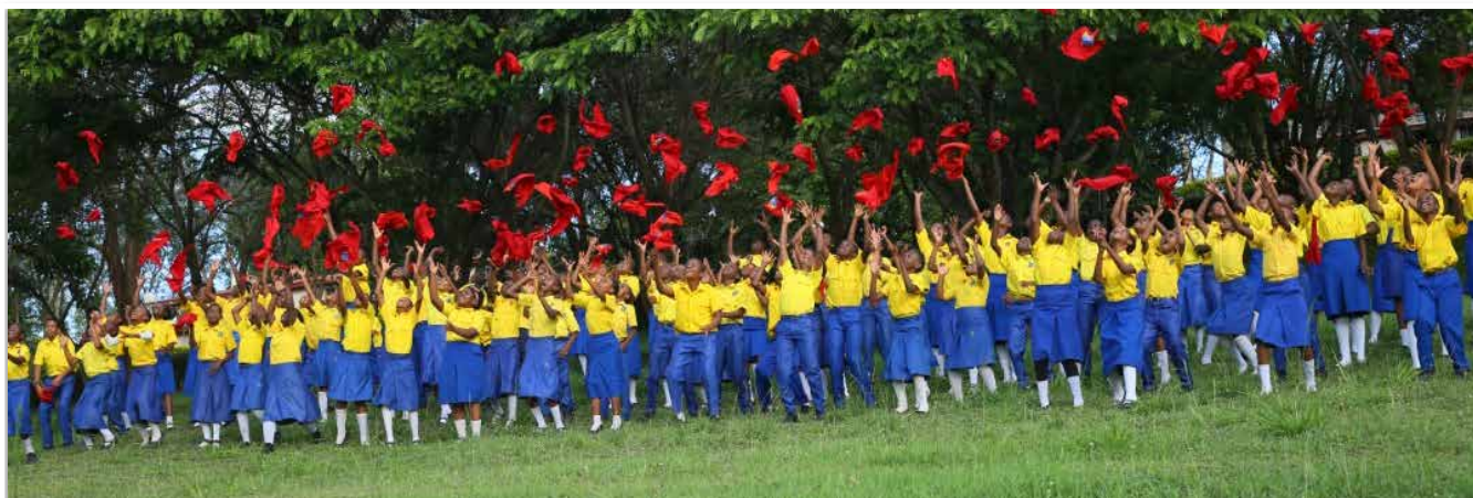
► Children in their ECD CHM uniforms rejoicing for their new songbook.