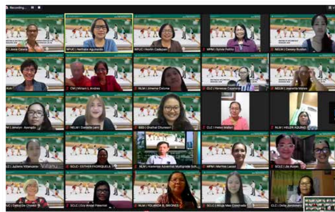
► NPUK Certification.