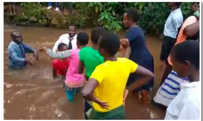
► Candidates baptized at the Keumbu site.

At another site, two siblings preached every night while another boy was signing the message for the deaf. Yes, even the deaf could hear the message of Jesus. Indeed, Children are using their gifts and talents to answer the call "I Will Go" to share the gospel with others.