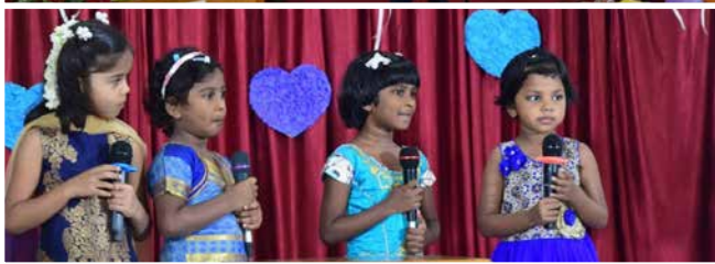
► South East India Union