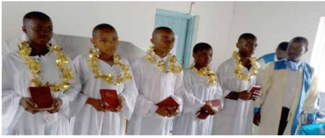
► NECUM TCI Evangelism – baptismal candidates.

meetings, visit people in the neighborhood, sing at the meetings, and distribute literatures and other items. Results: 29 people got baptized.