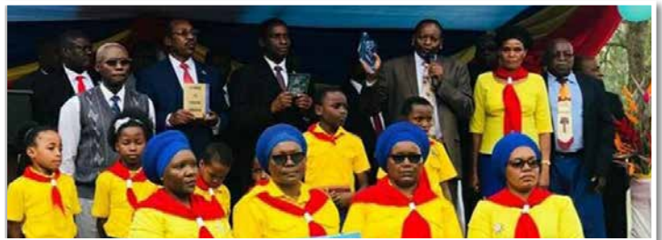
▶ Children's leaders with children at the songbook dedication service.