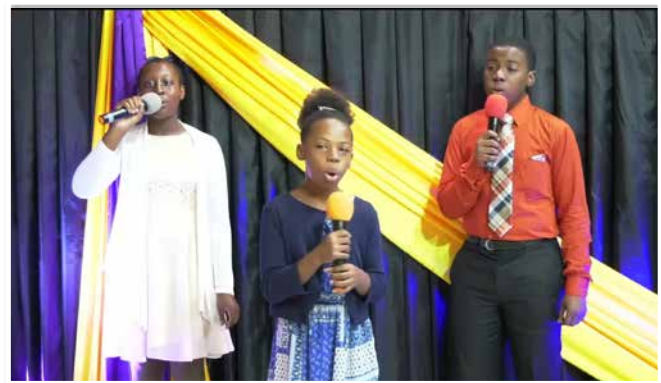
► Praise Team by children and adolescents.