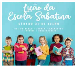
▶ SAD Sabbath School Lesson.