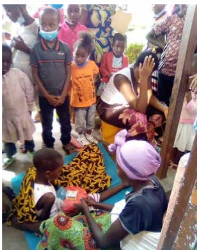
► Children reaching out to the needy and challenged children with their contributions.

Apart from the evening evangelistic meetings, children also got involved in reaching out to the needy and sick children and families with their contributions of food, clothes, and money. They visited these homes, prayed with them, distributed literature, and invited people to their meetings. Yes, God can use children to be great witnesses for Him!