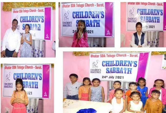
► Surat – Bhatar Telegu Church