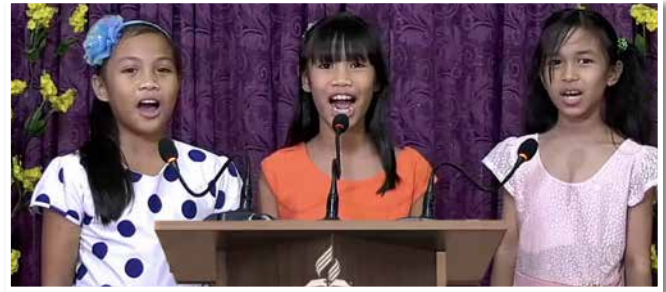
► Girls' trio from SLC.