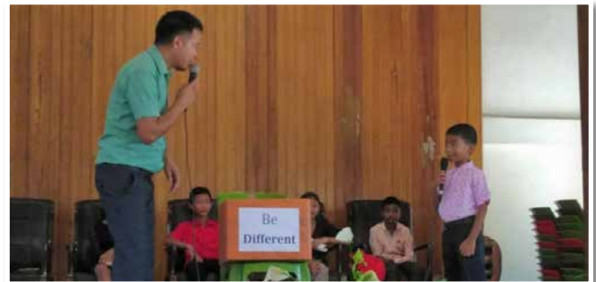
► North East Indian Union.

July 24, 2021 was a special day for children throughout the Southern Asia Division territory. All unions celebrated Children's Sabbath in their various churches. This is a special day set aside by churches all over the world for the purpose of highlighting and affirming the talents and gifts of children in our midst. It is a day set aside to celebrate children as active participants in the life of the church. Children participated in the worship service preaching, singing, reading Scripture, and performing dramas. It was wonderful to witness how children are using their gifts and talents for Jesus.