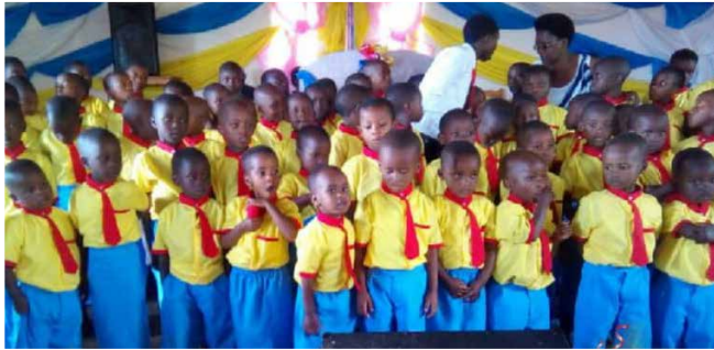
► Children's choir performing during TCI Evangelism in Burundi.