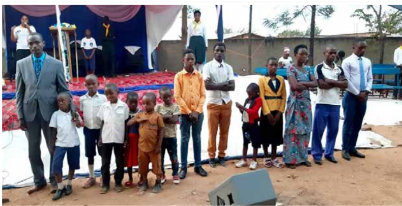
► Burundi TCI baptismal candidates.