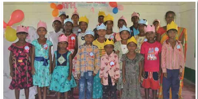
► South Central India Union