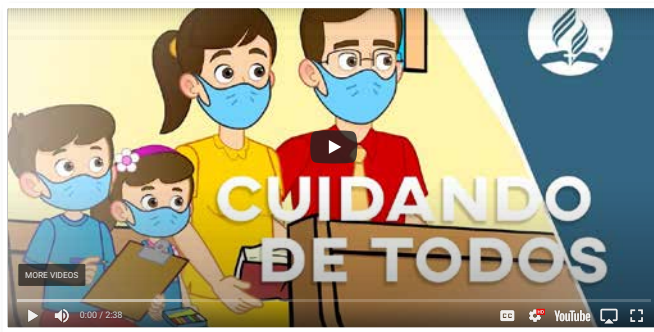
▶ SAD videos.

Sabbath School, some programs and events, and daily Bible reading (Revived by His Word) were all put on their social media for teachers, parents and kids (Facebook and Instagram). All programs were in Spanish and Portuguese.