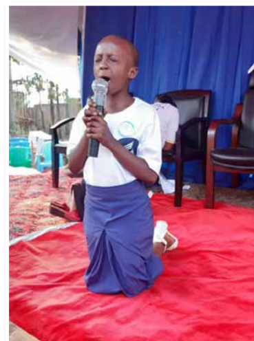
► Prayer consecration by a child preacher.